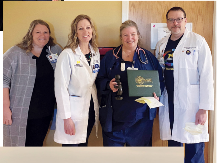
DAISY winner, NE winners and nominees